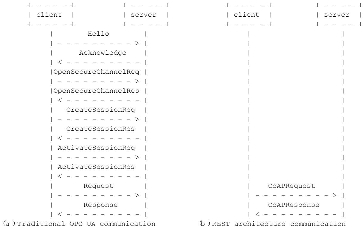
(a) Traditional OPC UA communication (b) REST architecture communication Figure 3. The communication of traditional OPC UA and the REST transmission

message and do not rely on other messages. The above features are in line with the REST architecture, due to CoAP is based on the REST architecture. Therefore, it is possible to simplify the interaction before the OPC UA performs the normal communication, and carry the OPC UA message by using the communication mode of the CoAP. Communication process is shown in Figure 3.